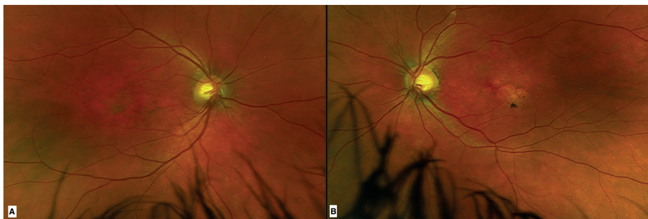
Figure 1. Color fundus photography with multiple subretinal yellow macular lesions in both eyes associated to central chorioretinal atrophy in the right eye (A) and juxtafoveal atrophy in the left eye (B)

The m.3243A>G mutation in the MT-TL1 gene, a mutation in the mitochondrial tRNA gene encoding leucine, is associated with a variety of mitochondrial disorders. In this case, the mutation resulted in bilateral retinal degeneration, which is a hallmark of mitochondrial retinopathy [4]. The retinal changes observed in the patient, including macular subretinal deposits and RPE atrophy, are characteristic of mitochondrial involvement. However, the degree of heteroplasmy in the retina is a major determinant in clinical presentation and it can vary significantly between cells, tissues and individuals, even in cases with the same mutation [5]. In this patient, a presumable high mutation load in the retina likely explains the central vi-