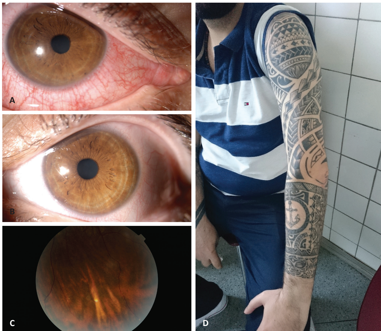
Fig. 2 – Patient no. 2

2a Tattoo of left arm without induration or redness of skin