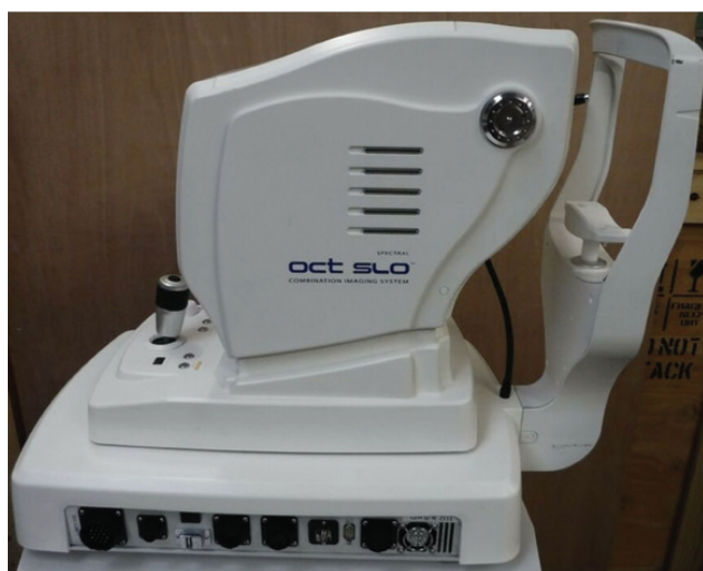
Fig. 1. Special Optical Coherence Tomography instrument

Progression of glaucoma took place in a total of 11 right eyes of the patients (designation 1). This means that 20 right eyes of the patients were without progression (designation 0) in the observation period. At the time of the first examination, a total of 21 eyes were negative (0) according to OCT in all quadrants. From this it ensues that only 1 eye produced a false negative. The average simplified categorised va-